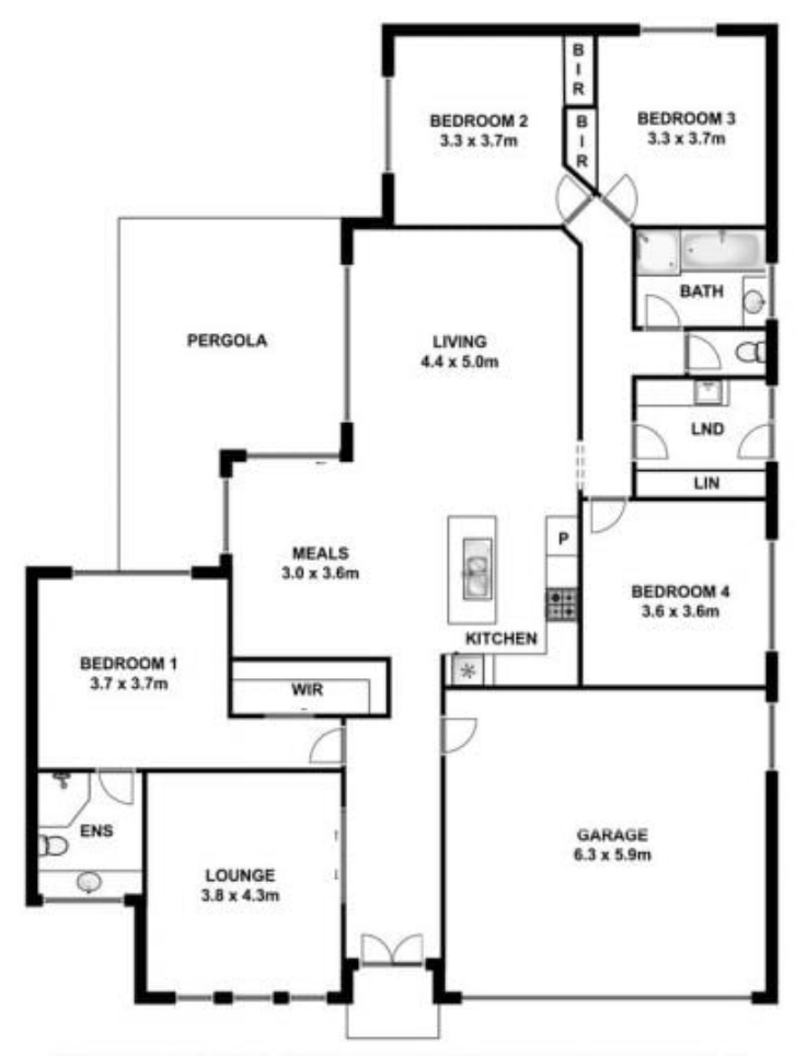
This drawing is for illustration purpose only. All measurements are approximate only and information intended to be relied upon should be independently verified.